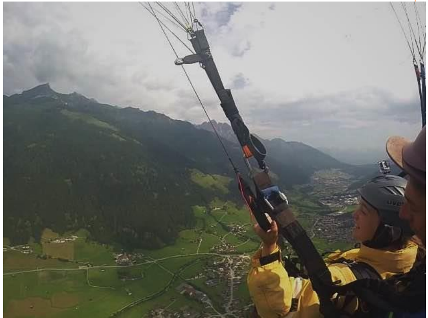
Austria